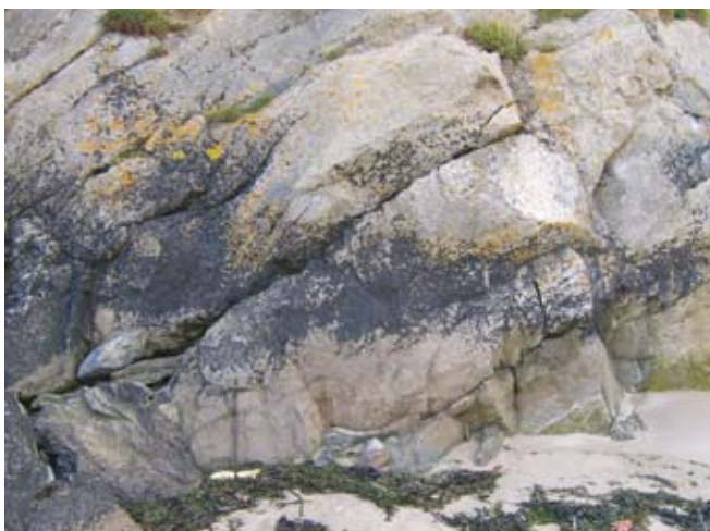
▲ Figure 12: Lichen on a rocky shoreline