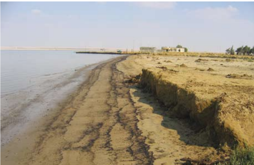
◀ Figure 21: Light oiling of a 200 metre long sand beach.

Approximately 5 litres of oil per metre strip along the beach