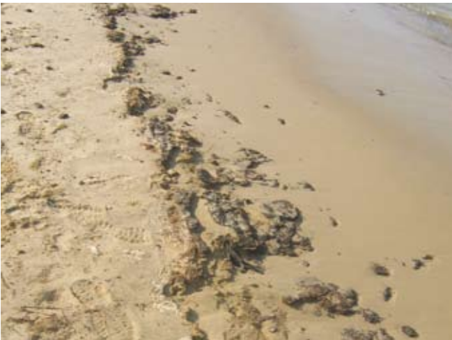
▲ Figure 3: Weathered oil on a sand beach