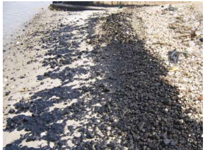
▲ Figure 6: Moderate oiling of a pebble beach, where some penetration into the substrate is likely