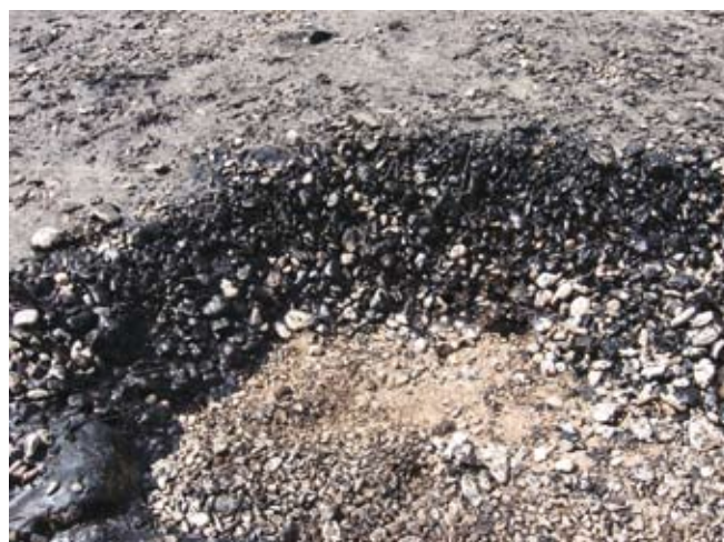
▲ Figure 10: Penetration of oil into a shingle beach