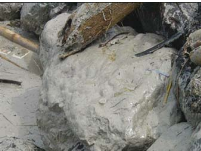
▲ Figure 4: Grey water-in-oil emulsion of palm oil on a rocky shoreline