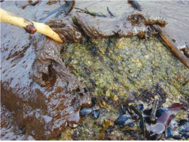
▲ Figure 2: Brown water-in-oil emulsion or "mousse"