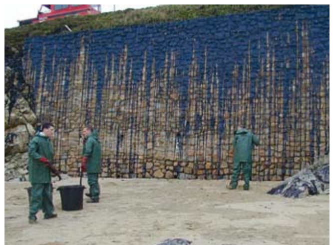
▲ Figure 18: Heavy oil stain running down a sea wall following a storm tide

altitude. Aerial surveillance should always be combined with spot checks on foot since, as previously discussed, many shoreline features viewed from a distance bear a close resemblance to oil. Careful attention should be given to identifying locations where the character of the shoreline changes or where the degree of oil coverage appears to change. Please refer to the separate Technical Information Paper on Aerial Observation of Oil for more details.