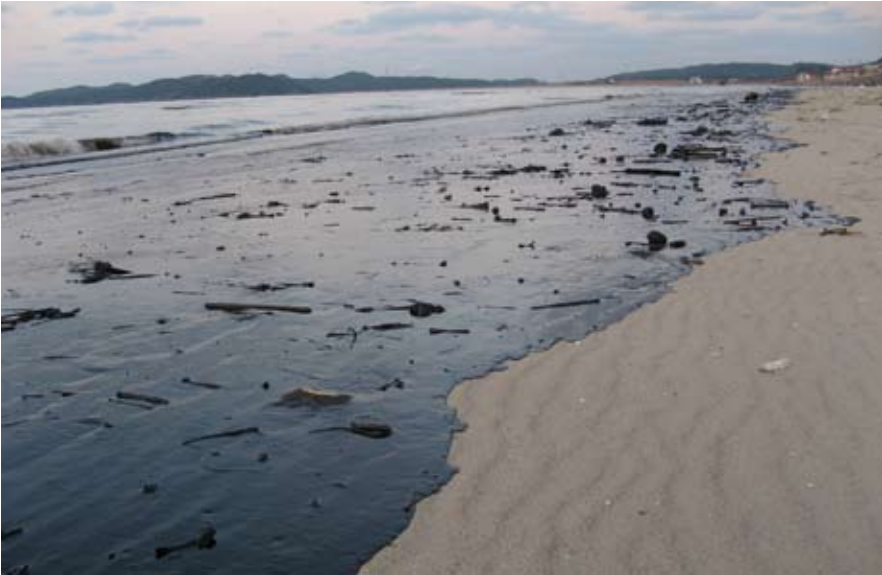
◀ Figure 19: Heavy oiling of a 300 metre long sand beach.

Average oil thickness \approx 1\text{cm} Width of oil band \approx 3\text{ metres}