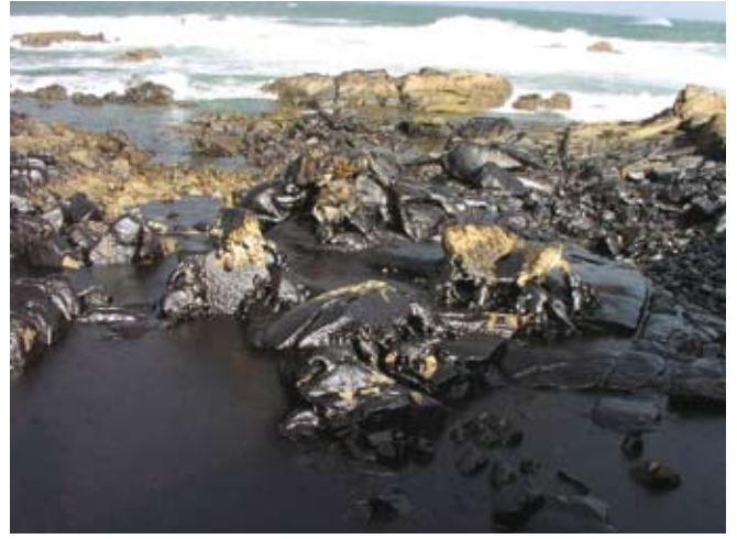
▲ Figure 5: Heavy oiling of a rocky shoreline, with significant pooling between rocks