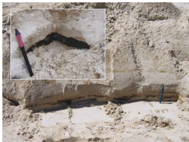
▲ Figure 9: Oil and oily substrate buried between layers of clean sand by wave action