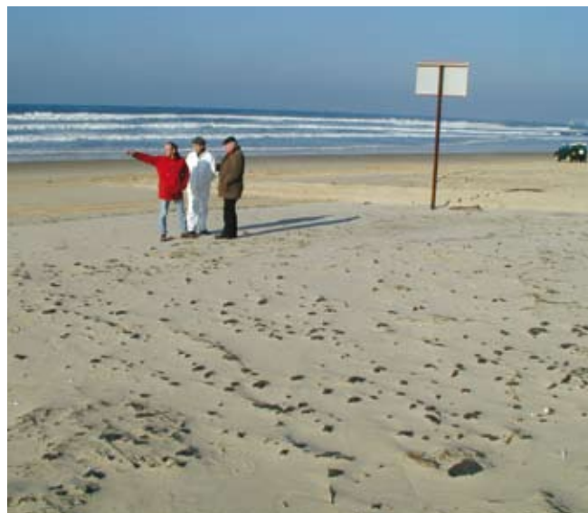
▲ Figure 1: Scattered tar balls on a sandy shore

Spills from ships can also involve fuel oil carried either as cargo or for fuel for the ship, as bunkers. Even with chemical analysis it can be difficult to distinguish between heavy fuel oil and weathered crude oil, particularly since fuel oil may also form