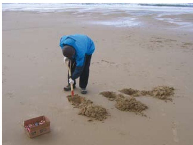
▲ Figure 23: Locating and quantifying the extent of buried oil can be a difficult task

Often the most compelling reason for quantifying stranded oil is to facilitate clean-up, therefore the total amount of oily material, as opposed to the amount of oil spilled, is the most relevant figure since any debris, sand or water mixed with the oil will also require removal. However, on sandy beaches it is worth noting that removal of oil-saturated sand may involve a quantity of material at least ten times greater than the oil itself. This may lead to problems with beach erosion, temporary storage and final disposal of the collected material.