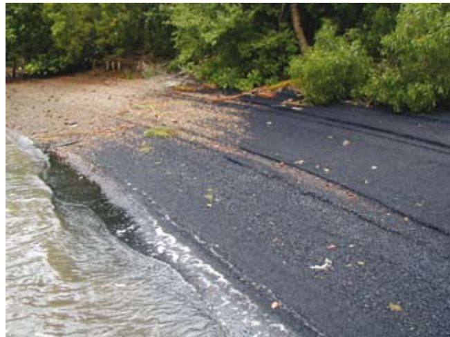
▲ Figure 14: Black vegetable matter