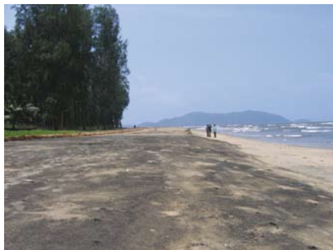
▲ Figure 15: Coal dust resembling oil on a sandy beach