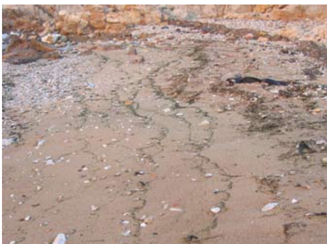
▲ Figure 13: Stranded sea vegetation resembling light oiling from a distance