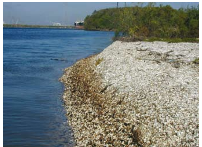
▲ Figure 7: Light oiling of a shingle beach