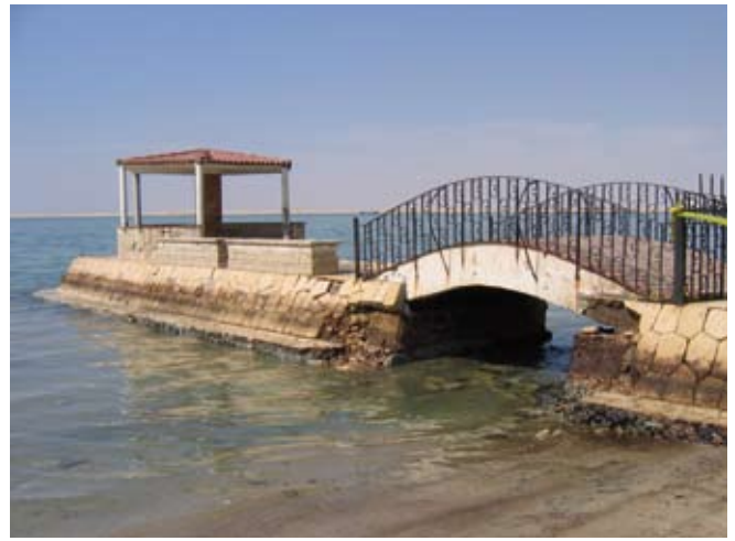
▲ Figure 17: Light oil staining of a stone jetty. This may be easily confused with algae growth

First, the overall extent of the contamination along a coastline can be estimated and marked on a chart or map. In the case of a major spill a helicopter over-flight is usually the most efficient and convenient way of gaining a general impression. A fixed-wing aircraft usually travels too fast for a good coastal inspection at low