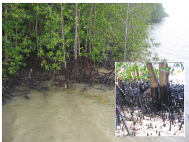
▲ Figure 16: Dark, wet mangrove roots may be confused with oiled mangrove roots (inset)