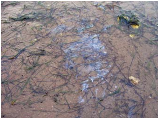
▲ Figure 11: Natural sheen produced by rotting seagrass