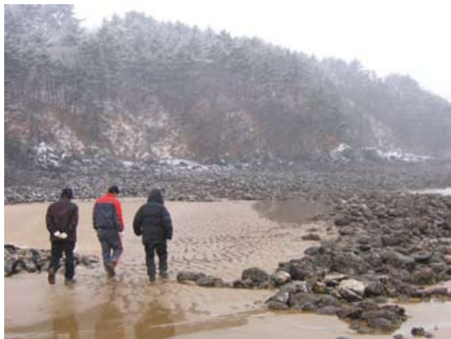
▲ Figure 22: Walking the shoreline or "ground truthing" allows a more accurate quantification of the extent of contamination

Quantifying stranded oil in this way only yields an approximate figure due to several unavoidable sources of error. On a sandy beach the affected area can be calculated relatively easily, but the possibility of oil penetrating into the beach substrate should be remembered. Oil penetration is likely to be greater as the grain size of the beach substrate increases and therefore, the larger the grain size, the more difficult it can be to estimate the volume of oil on the shoreline. Occasionally the volume of penetrated oil will be impossible to estimate, but when sand is uniformly saturated, a useful rule-of-thumb is that the pure oil