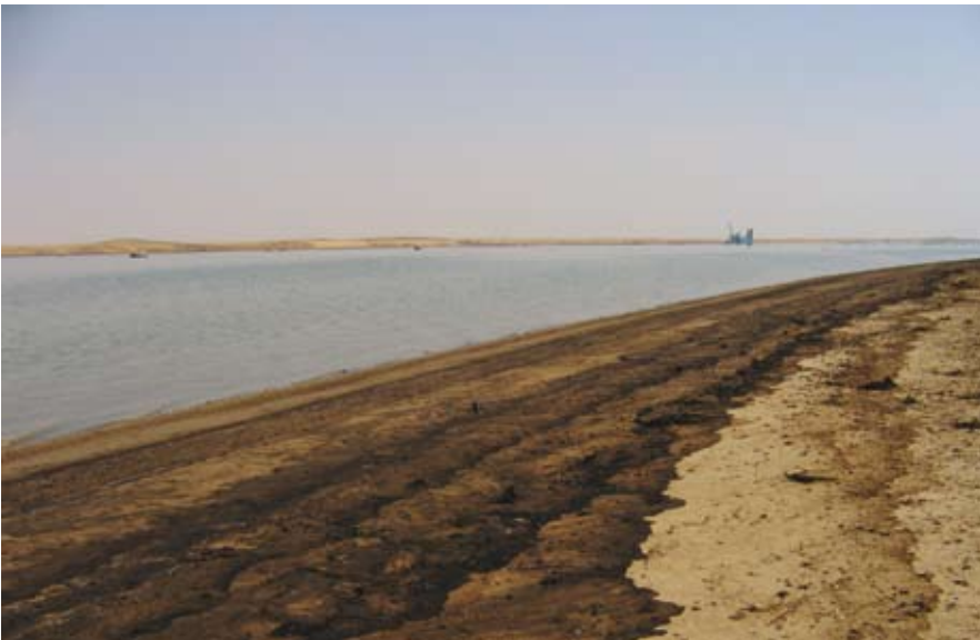
◀ Figure 20: Moderate, broken oiling of a 500 metre long sand beach.

Approximately 30 litres of oil per metre strip along the beach