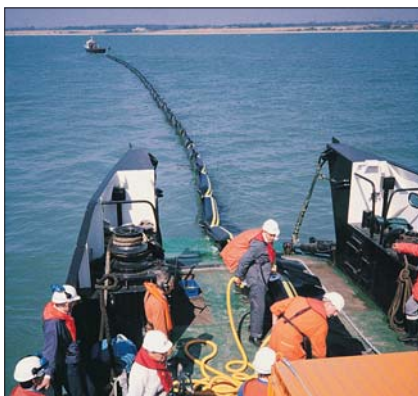
Tiered Preparedness and Response can be applied to all potential oil spills, from small operational spillages to a worst case, at sea or on land.

dramatically. More recently, corporate-led oil spill arrangements have been supplemented by more divergent business unit or regional led arrangements. This shift has coincided with strong growth in exploration and production activities in ever more remote, environmentally sensitive and potentially challenging places. The global oil spill risk profile is constantly changing and the need to ensure that appropriate arrangements are in place is just as relevant now as it ever has been.