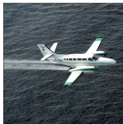
Aircraft dispersant capabilities may be provided for a rapid response.