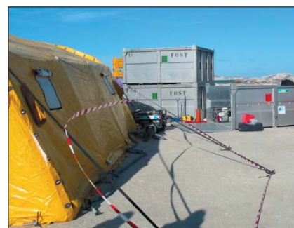
Tier 2 resources awaiting deployment at the scene of a spill.